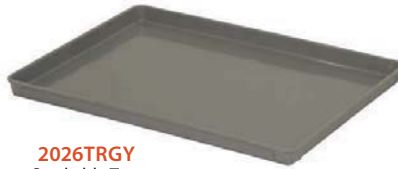
2026TRGY Stackable Tray