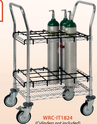
WRC-IT1824 (Cylinders not included)

Mobile unit can transport up to 12 of the D and/or E cylinders. Protective vinyl coated wires separate and protect cylinders. Unit consists of two u-handles, 4 donut bumpers, 4 conductive swivel casters (2 with brakes), 1 wire shelf and 2 frames with coated wire grid shelf. Wire Finish: Chrome