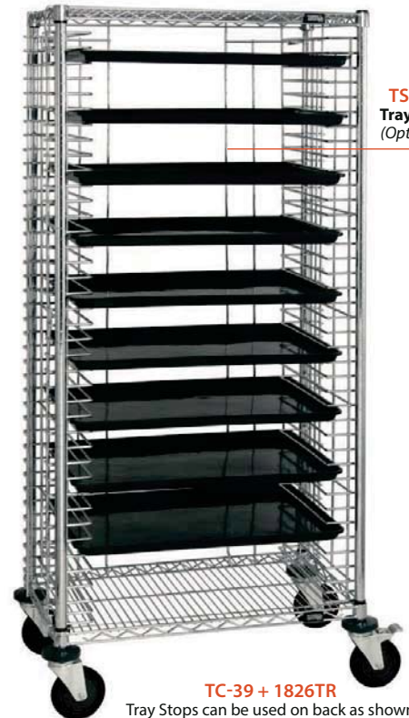
TC-39 + 1826TR Tray Stops can be used on back as shown here or one in the back and one in the front. (Trays sold separately)