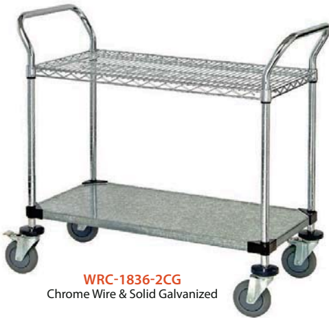
WRC-1836-2CG Chrome Wire & Solid Galvanized