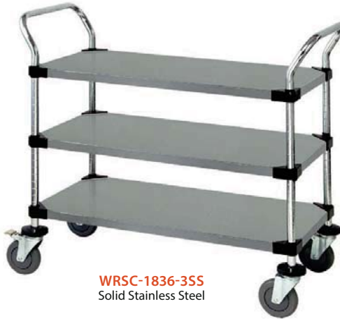
WRSC-1836-3SS Solid Stainless Steel