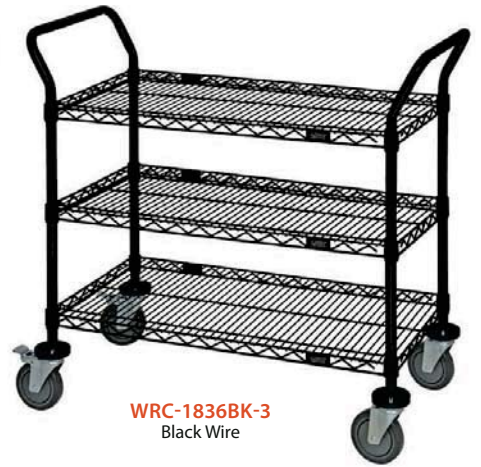
WRC-1836BK-3 Black Wire