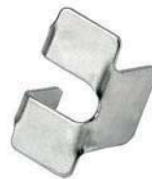
QAT Front/Back Tab