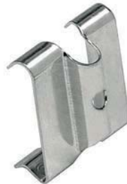
QSRT Side / Solid Shelf Tab