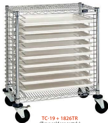
TC-19 + 1826TR (Trays sold separately)