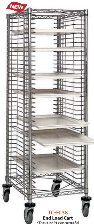
TC-EL38 End Load Cart (Trays sold separately)