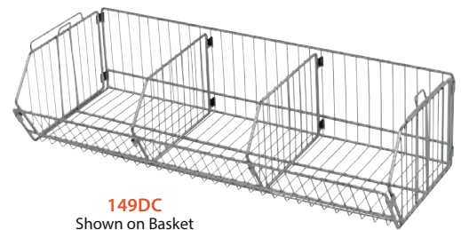
149DC Shown on Basket