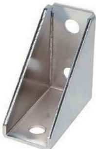
PWB Post Mount Bracket Used to secure cantilever post mount units and free standing shelving units to wall. Sold in a pack of 4. (Mounting Screws are not included)