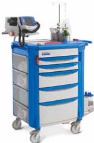
Cat. No. LECCRP7 Code Response Cart