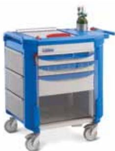
Basic Cart with side bins and tank holder