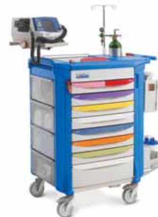
Cat. No. LECPEDS2 Code Response Cart