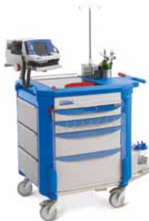
Cat. No. LECCRP3 Code Response Cart