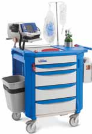
Cat. No. LECCRP2 Code Response Cart