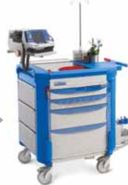
Upgrade again with drawers, trays & dividers

One of the best features about Lifeline is its upgradeability. Start with a basic model based on budget or current requirements and buy the confidence that it can change as your needs change.