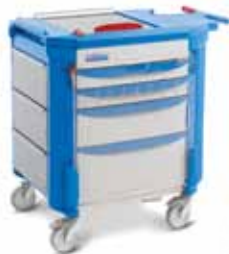
STANDARD DRAWER PULL COLOR CODE BLUE

Note: Width includes optional backboard holders.