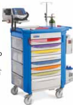
PEDIATRIC DRAWER AND COLOR KIT

(Includes drawers, colored pulls and labels only)