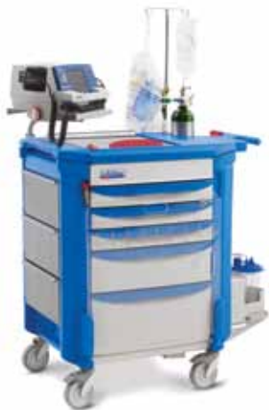
Cat. No. LECCRP5 Code Response Cart