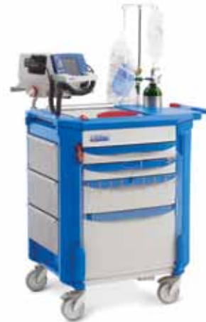
Cat. No. LECCRP4 Code Response Cart