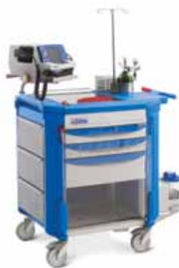
Upgrade with defibrillator arm, storage bin and suction shelf